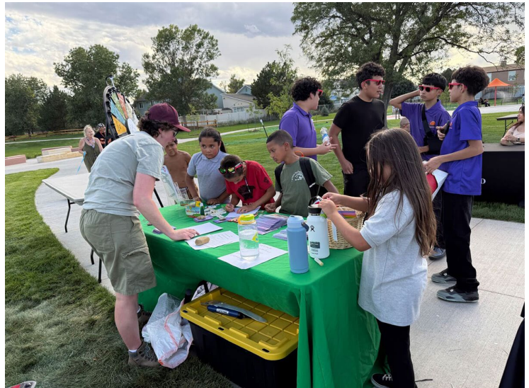
Generation Wild partners will be providing programming for youth in Greeley throughout the 2026 season.

The Generation Wild Greeley Coalition is heading into spring with strong collaboration and several programs already taking shape. Partners are preparing for a busy season of archery clinics, clean-ups, outdoor workshops, field trips, and youth leadership activities. Recent highlights include Cal-Wood Education Center securing six free week-long summer camp spots for Greeley middle and high school students, Greeley Dream Team expanding their spring field trips, and Lutheran Family Services hosting a cultural-competency training that sparked meaningful reflection across partners.