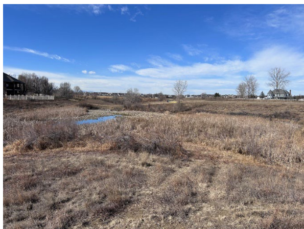
The Mountain Vista stormwater detention basin, after recent work to meet regulatory requirements. NAT and Stormwater partner on management of the site.

A major ecosystem service is flood mitigation and water quality filtering. Natural wetlands are fantastic systems to slow down, absorb, and clean stormwater as it rushes