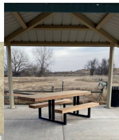
Continued improvements at Poudre Ponds include new furniture.