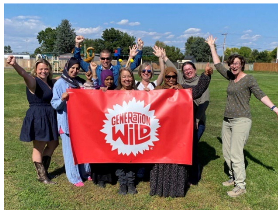
Project partners celebrate the announcement of the $1.75M Generation Wild grant award for Generation Wild Greeley.

On September 18, the board for Great Outdoors Colorado (GOCO) voted to approve $24.4 million in investment in 15 Generation Wild coalitions across the state. Greeley is one of four new communities joining Generation Wild this year. Led by the City of Greeley, the Generation Wild Greeley coalition will receive $1.75 million over the next five years to offer no/low-cost outdoor programs for youth and families living in east Greeley. These funds will be distributed across 15 organizations, including Lutheran Family Services Rocky Mountains, Poudre Learning Center, City of Greeley Recreation, Boys & Girls Club of Weld County, Blazing Cloud Consulting, Cal-Wood Education Center, Colorado Youth Outdoors, Community Impact Collaborative, Greeley Dream Team, Northern Colorado Health Alliance, Soccer Without Borders, University of Northern Colorado’s Active Schools Institute, Voices of the Land, and