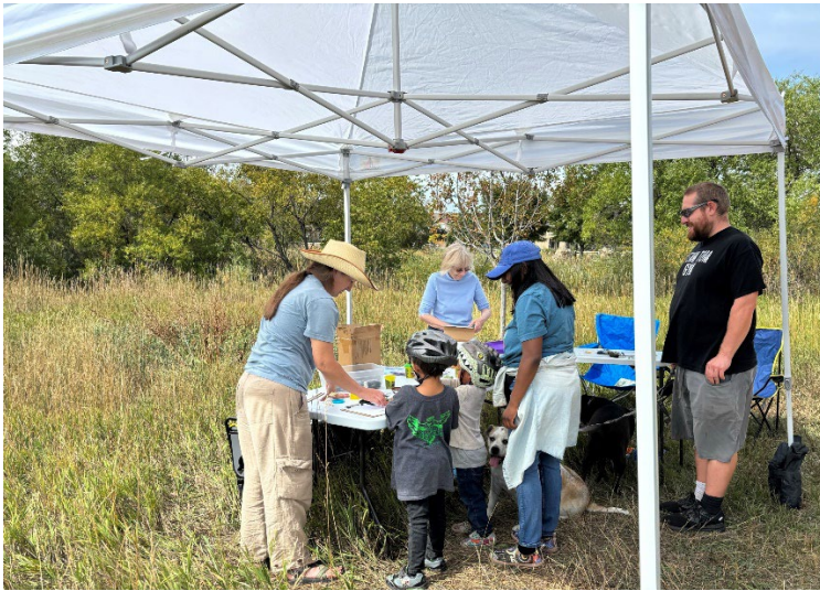
A family stops for a few minutes on their trail ride to engage with the activities at one of NAT's recent trail pop-up events.

With the hiring of an outreach intern, NAT recently launched a series of pop-up events called “Know Your Natural Areas” across the community. The pop-up events occur every other week from Sept. 13 to Nov. 8 in different natural areas across the city. Partner organizations will share the tent with NAT to share family-friendly activities that teach the community about various rules or trail etiquette, such as putting trash in trash cans, keeping dogs on leash, using bike lights, and staying on the trail. The first pop-up event, on Sept. 13 at Homestead Park/Gateway Lakes, was attended by 30 people.