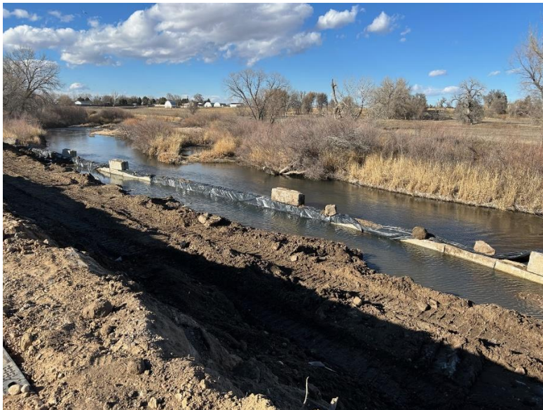
A coffer dam was placed in the river at the Poudre Ponds repair project site to de-water the worksite ahead of constructing the boulder wall.