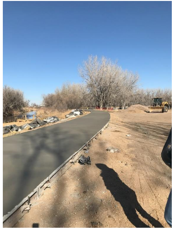
The concrete trail was poured in the Duran repair project in February.

The river repair and protection project at Poudre Ponds continued in February. The first phase of the project to remove decades of dumped materials along the southern riverbank has been completed. The next phase of the project has begun, building the boulder wall along the riverbank. The wall will protect the southern riverbank in flood events, along with providing habitat opportunity for native riparian species to establish, preventing erosion into the future. To construct the wall, a coffer dam had to be constructed in the river to provide a dry area for the wall to be constructed. The trail will remain closed until further notice, with the project’s current schedule projecting a mid-spring completion timeframe.